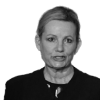
Sussan Ley Australia