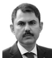
Murat Kurum Turkey

Minister of Environment and Urban Planning