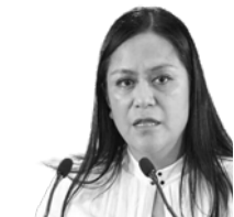
María Luisa Albores Mexico

Secretary of the Environment and Natural Resources