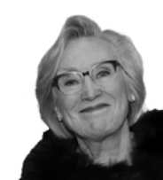
Carolyn Bennett Canada