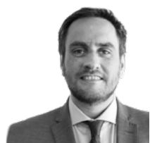
Juan Cabadié Argentina

Minister of Environment and Sustainable Development