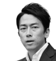
Shinjiro Koizumi Japan