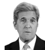
John Kerry United States