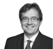
Jonathan Wilkinson Canada

Minister of Fisheries, Minister of Environment and Climate Change