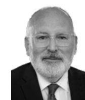
Frans Timmermans EU

Executive Vice-President for the European Green Deal