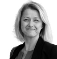
Barbara Pompili France