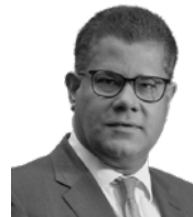
Alok Sharma United Kingdom

President for COP26 and Minister of State at the Cabinet Office