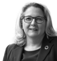
Svenja Schulze Germany

Minister of the Environment, Nature Conservation and Nuclear Safety