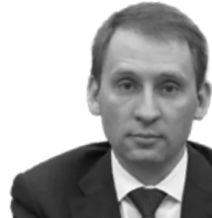
Alexander Kozlov Russia

Minister of Natural Resources and Ecology