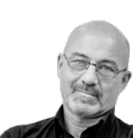
Roberto Cingolani Italy