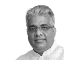
Bhupender Yadav India

Minister of Environment, Forest and Climate Change