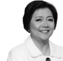
Siti Nurbaya Bakar Indonesia