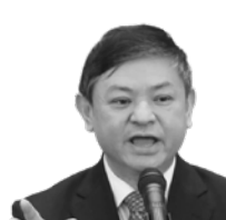
Huang Runqiu China