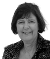
Barbara Creecy South Africa